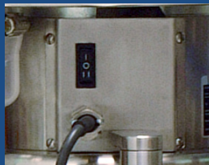
Simple control with two speed switch