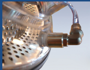
Dust agitation system for optimum dedusting