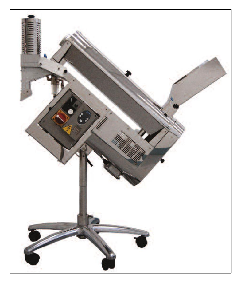
Figure 3: A brush-type deduster, Foto: Courtesy of MG America