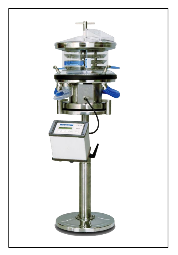
Figure 4: A downward conveying vertical deduster, Foto: Krämer AG