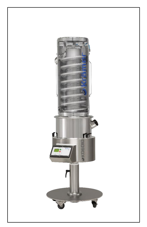
Figure 5: An upward conveying vertical deduster