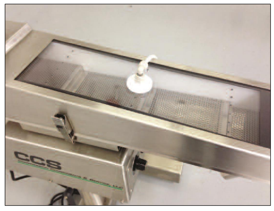
Figure 2: A horizontal deduster, Foto: Courtesy of Compression Components & Services